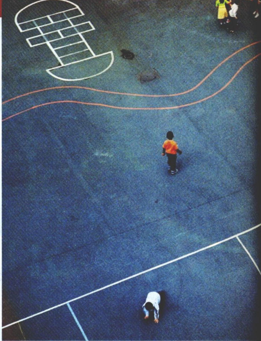
■ Kids growing up in Europe will pay dearly for a lavish social-welfare system, but Europeans, with

Europe cannot save itself, critics argue, because it has lost any idea what it stands for. The EU recently spent a half decade trying to draft a new constitution, only to see it rejected by discontented Dutch and French voters seemingly fed up with too much "Europe." An anti-Muslim, neonationalist backlash is almost inevitable as Europe fails to integrate its rapidly growing minority populations, warn American conservatives like columnist Mark Steyn, who predicts Europeans will soon wake up "to the call to prayer from a muezzin." The bottom line: Europe is lost.