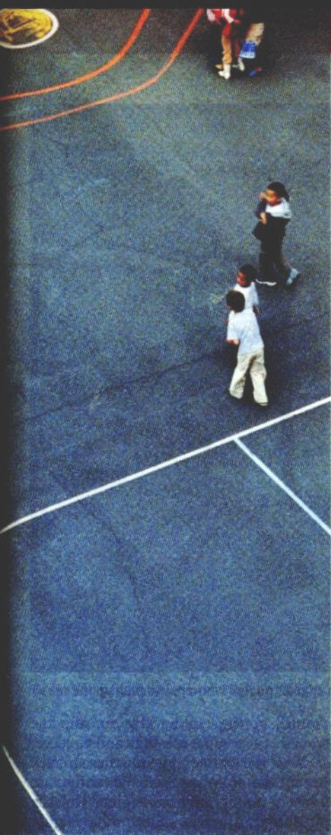
ceptions, are loath to import the American model

tions. Among the new EU members of Eastern Europe, average growth of 5 percent exceeds that of the United States. Slovakia, Estonia and Latvia are all growing at 10 percent or more annually.