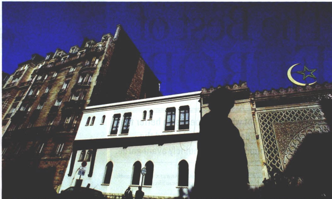
■ Muslims account for 5 percent of immigrants in Europe, but laws have lately become more selective; above, La Grande Mosquée in Paris

is bipolar, and the other pole is Europe.