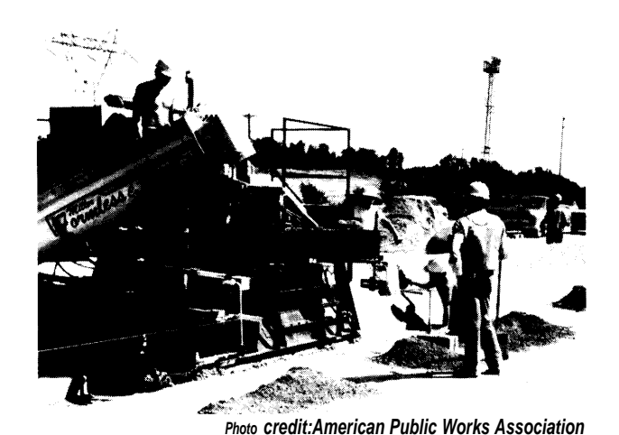
Concrete's low cost, durability, and workability at the time of installation make it one of the most widely used construction materials.

the concrete to set can produce concrete that can maintain its strength for longer periods of time.