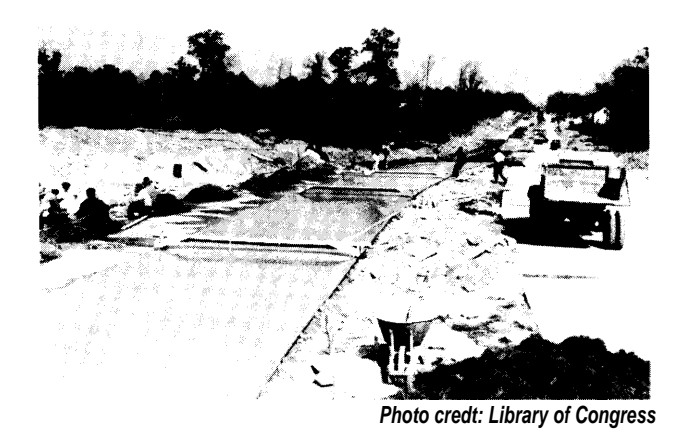
Today's technologies make this nonmechanized highway construction project of the 1940s look outdated.

These categories are not new, but a number of technological advances have led to devices and