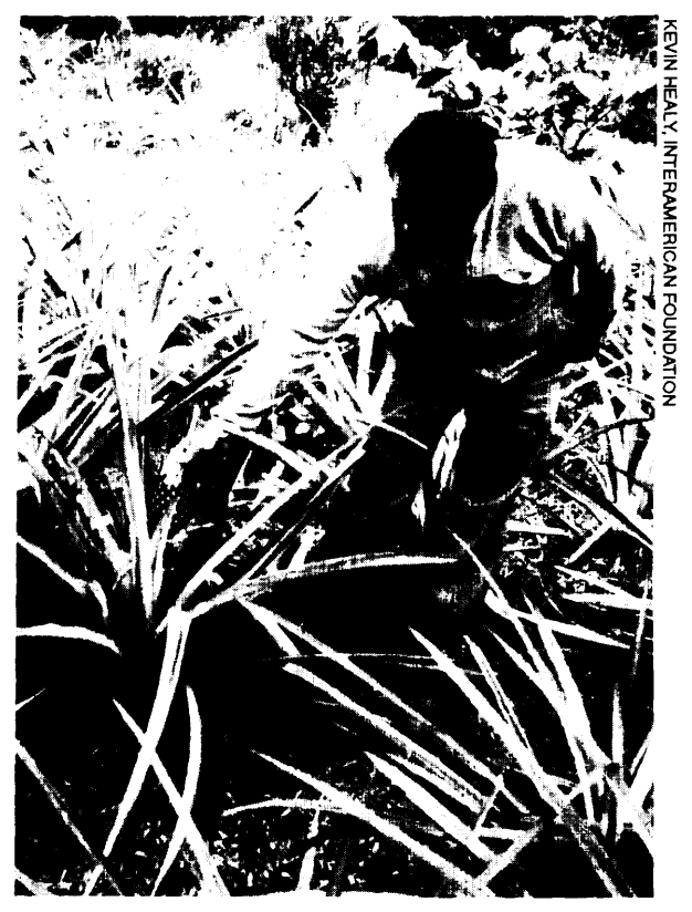
Pineapple is being produced as an alternative crop in the Chapare, Bolivia. Private sector investment in a local processing facility for Chapare and Santa Cruz pineapples may promote the value of production.

Efforts are also underway to examine essential oils (e.g., eucalyptus, pyrethrum oils); natural plant chemicals (e.g., xanthophyll); spices (e.g., piper nigrum ); tropical fruits (e.g., pineapple, passionfruit, bananas, carambola); and nuts (e.g., macadamia). Pineapples and bananas seem to be promising in terms of fresh export and there has been some success with shipments to Argentina and northern Chile. Nontraditional crops of turmeric ( Curcuma domestica ) and ginger ( Zingiber officinale ) demonstrate export potential and production is underway at a trial level. Several other