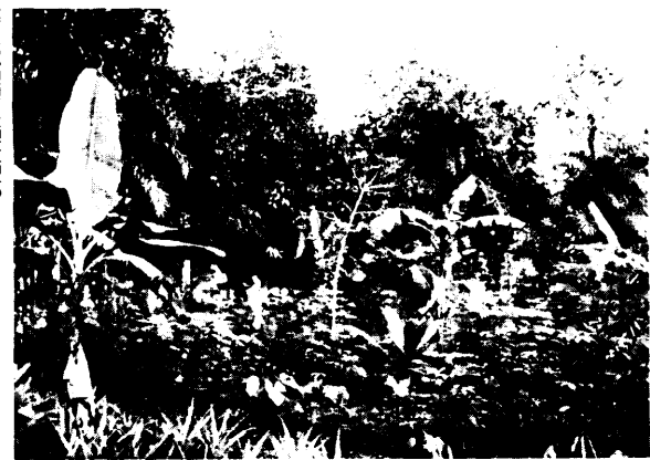
Home gardens are a common feature of tropical agriculture. This diversified home garden agroforestry system in Costa Rica generates multiple products including banana, papaya, and pineapple.

Much of the coca production region is characterized by brush fallow and poor second-growth forest that could be used for agroforestry. The U.S. Agency for International Development (AID) sponsored research in the Chapare region suggests that many of the promising agricultural alternatives to coca are nontraditional tree crops, such as macadamia and peach palm and longcycle perennials such as passion fruit and black pepper (4). Incorporating these economic crops into an agroforestry system could provide increased economic and environmental benefits for producers.