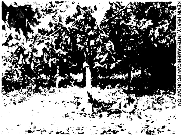
Simple processing and storage requirements make cocoa (Theobroma cacao) an attractive alternative in remote areas. Shown here is cocoa production in the Alto Beni, Bolivia.

In addition to agricultural resources, forest, aquatic, and wildlife resource exploitation could offer alternative livelihoods. Tropical forest resources have received increased global attention over the last several decades. Tropical timber exports were key in national economies in the mid- 1900s and continue to command high prices in the international market. Constraints to continued or increased exploitation largely arise from concerns over conservation of biological diversity and potential adverse global environmental effects. Indeed, consumer boycotts of tropical