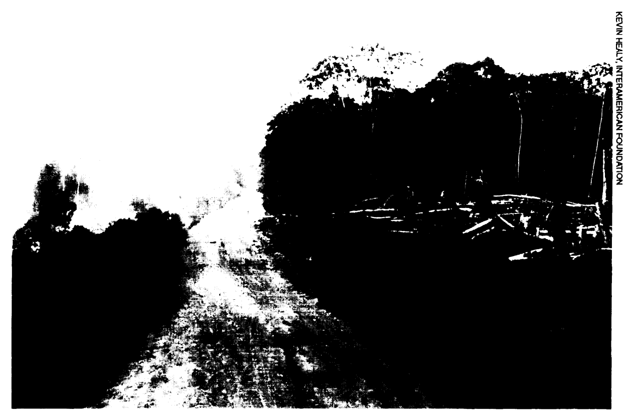
Slash-and-burn forest clearing commonly is used to access agricultural lands, but land productivity tends to be short-lived. Evidence suggests that maintaining forests for sustainable timber operations and extractive reserves may offer longer term economic benefits.

small areas of planted forest are found in the coca-producing regions.