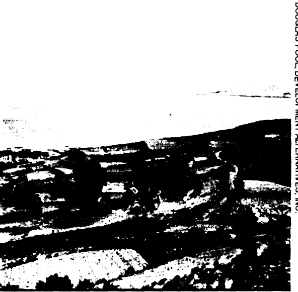
Productivity estimates for Luke Titicaca, shared by Bolivia and Peru and covering 8,135 square kilometers range from 50,000 to 250,000 metric tons--far above actual yield estimates.

Aquatic resource systems of the Andean region harbor significant potential for enhanced production. The numerous lakes and river systems include a variety of harvestable species that could support artisanal and commercial fisheries under good management conditions and application of appropriate technology. Some systems clearly are underexploited and could provide significant increases in domestic food production.