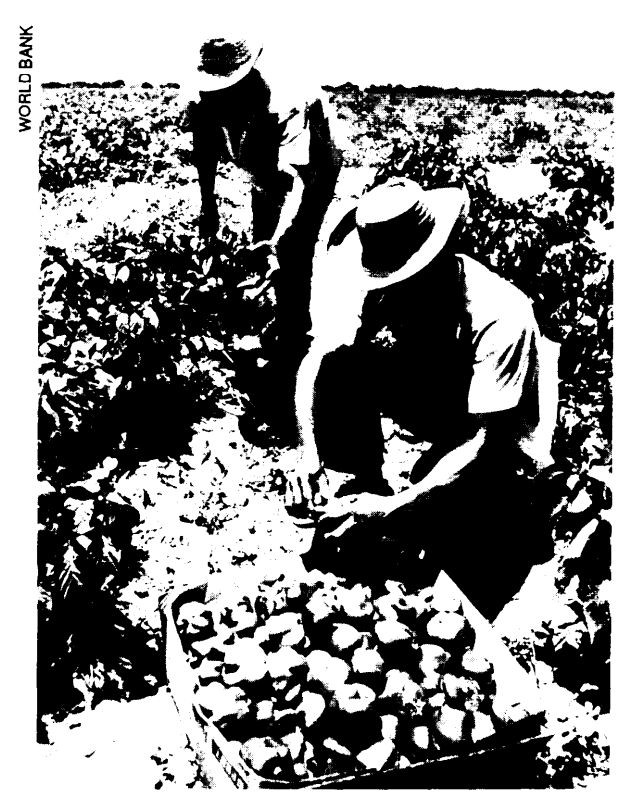
Irrigation networks can increase agricultural production, particularly in areas subject to seasonal rainfall. Here, farmers harvest green peppers on an irrigated cooperative farm.

option to reduce the perceived risk of transition to alternative systems for some coca producers. Coordinated effort could be placed on developing necessary infrastructure to support an agricultural export industry along with value-added processing to increase the economic benefits for local communities.