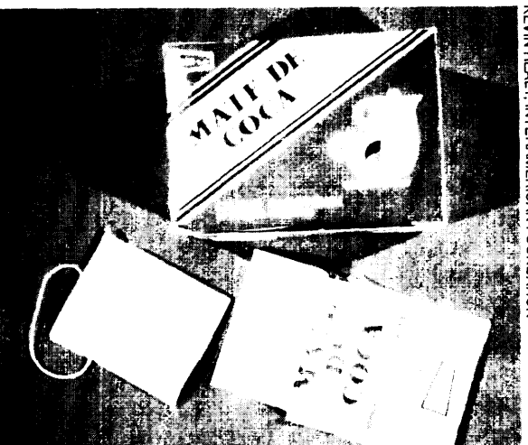
Increasing markets for legal coca products (e.g., coca tea or maté de coca) may reduce the hardship for producers adopting alternative crop systems.

Transitional systems that allow coca producers to shift their production systems gradually to legitimate crops may offer an opportunity to ease risk-averse farmers into legitimate agricultural productions systems. While participants in current substitution programs continue to produce some amount of coca, focus remains on coca replacement systems rather than integrated systems. This may have several effects. First, farmers may maintain separate fields for coca and substitution crops, dividing time and effort and potentially reducing yields of the legitimate crops. Secondly, with coca being the "cash crop," farmers are more likely to weight their attention toward the "sure thing' as opposed to the alternative, particularly in times of adversity when yields of both maybe threatened. Lastly, the replacement approach may discourage participation by risk-averse farmers who are unwilling to eliminate coca or by those who do not have sufficient land or labor to tend separate plots. Alternatively, integrated systems that incorporate alternative crops in coca production could provide source reduction benefits as well as improved agronomic attention to legitimate production by the farmer.