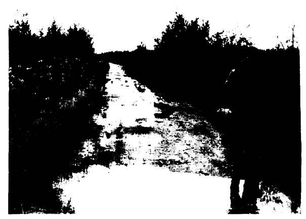
The inadequate condition of roads in some villages often results in spillage of human waste during its transportation to disposal sites

Unfortunately, operation and maintenance costs are generally too high for Native communities to afford. Operation of sewer and water systems in remote villages, generally considered the province of local governments, is typically "in the