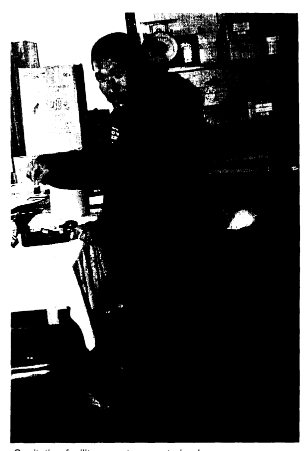
Sanitation facility operators are trained in many technical areas, including water chemistry and treatment, vacuum pumps, operational safety and record keeping.

It is difficult to generate jobs. Some people are trying to develop their own skills. Training would be helpful but once investments are made