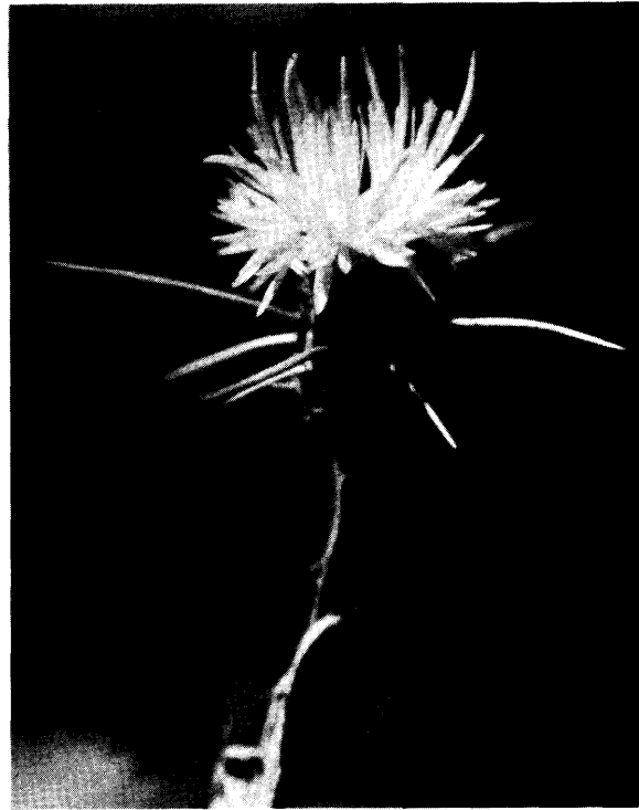
Many land managers expect biological control to be an important part of the solution to widespread pests on low-value lands—such as this yellow starthistle ( Centaurea solstitialis ), a noxious weed that is now spreading across western rangelands.

The effectiveness of federal efforts to bring BBTs into widespread use could be improved. Better mechanisms are needed to ensure that the federal government's annual investment of more than $135 million into BBT research delivers