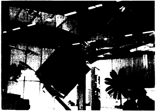
Soviet COSPAS satellite, as displayed at 1985 Paris Air Show