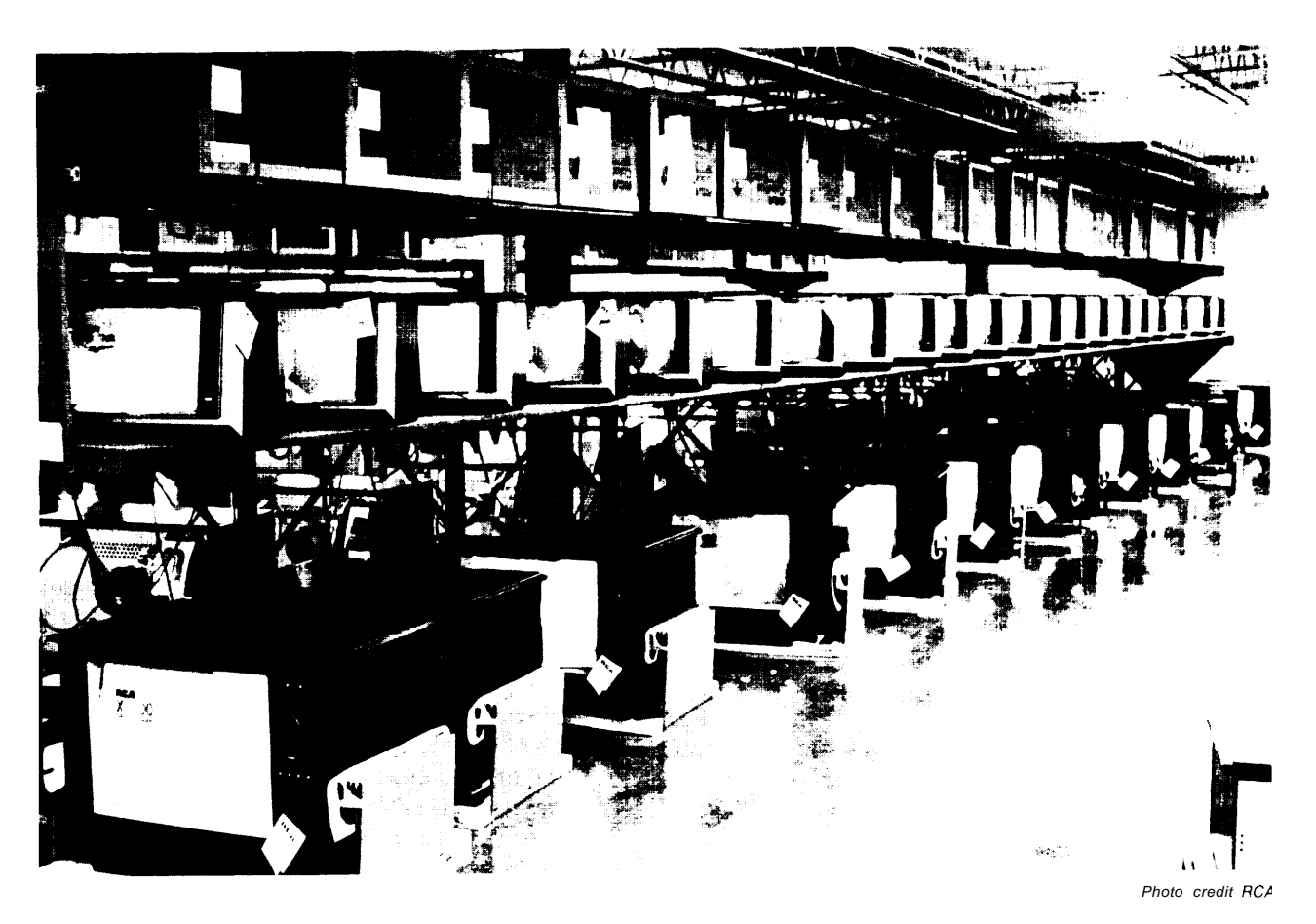
Color TVs undergoing long-term tests

dumped TVs in the American market. The case then went to ITC for determination of injury. Later that year, ITC returned a positive finding, concluding that the dumped TVs had injured the U.S. industry and clearing the way for the assessment and collection of antidumping duties—at that time still the responsibility of Treasury. Importers of TVs from Japan were required to post a 9 percent bond toward these duties.