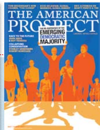
Movement Watch: The search for a sign of an emerging Democratic majority has been ongoing, making the cover in January 2005 and July/August 2007.