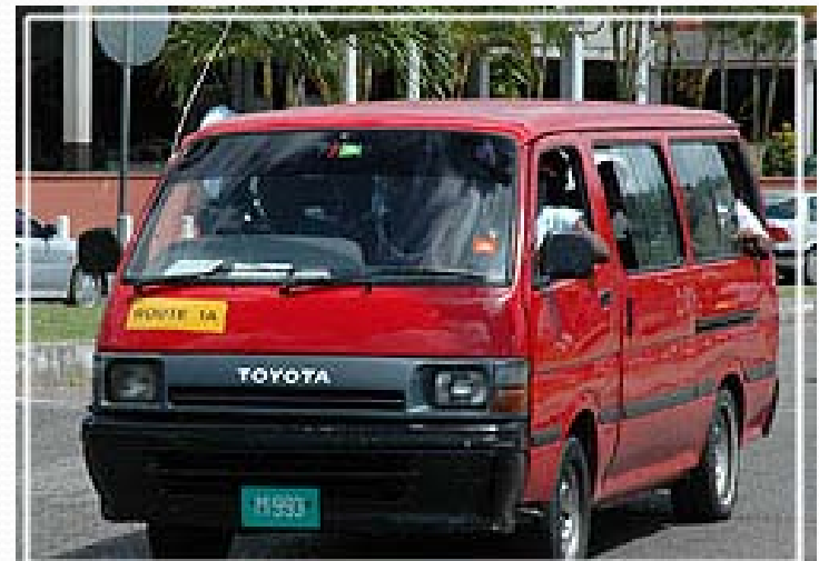
Public Transportation - Bus