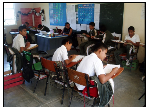
In the CEAC classroom

Each of these different environmental, social, and economic conditions dramatically affects the classroom, the teacher, and the role of education in the community. Every new place further complicates my understanding of Mexico, strategies to increase the level of basic education, the power of education to divide and reproduce, and my relationship to the hierarchies imbedded in all aspects of life here. I move constantly between the rural and the urban, the indigenous and the mestizo (mixed race), the economically devastated and the elite, the South and the North. My time here has made me feel simultaneously more grateful and culpable for the privilege of this mobility.