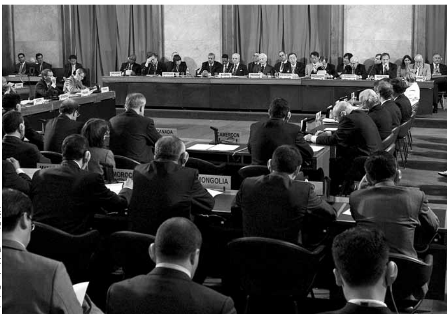
The Conference on Disarmament meets in Geneva May 19, 2009. Pakistan has objected to a work plan that would allow the UN body to proceed with negotiations on a fissile material cutoff treaty.

In May 2009, for the first time in 10 years, with Pakistan’s assent the CD adopted a program of work organized around four working groups, one of which