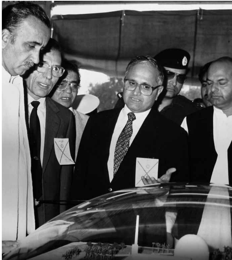
Pakistan Atomic Energy Commission

Pakistan rejected the CD plan of work proposed in early March. A number of countries associated with the CD Group of 21, including Egypt, Indonesia, Iran, North Korea, Sri Lanka, and Syria, have joined Pakistan in arguing for a more “balanced” program of work, highlighting in particular the need for talks on nuclear disarmament. 15 China also did not endorse the CD plan of work. Some states may simply be remaining silent about their opposition to the treaty and taking advantage of Pakistan’s refusal to permit talks on an FMCT. Israeli Prime Minister Benjamin Netanyahu told President Bill Clinton in 1999, “We will never sign the treaty, and do not delude yourselves—no pressure will help. We will not sign the