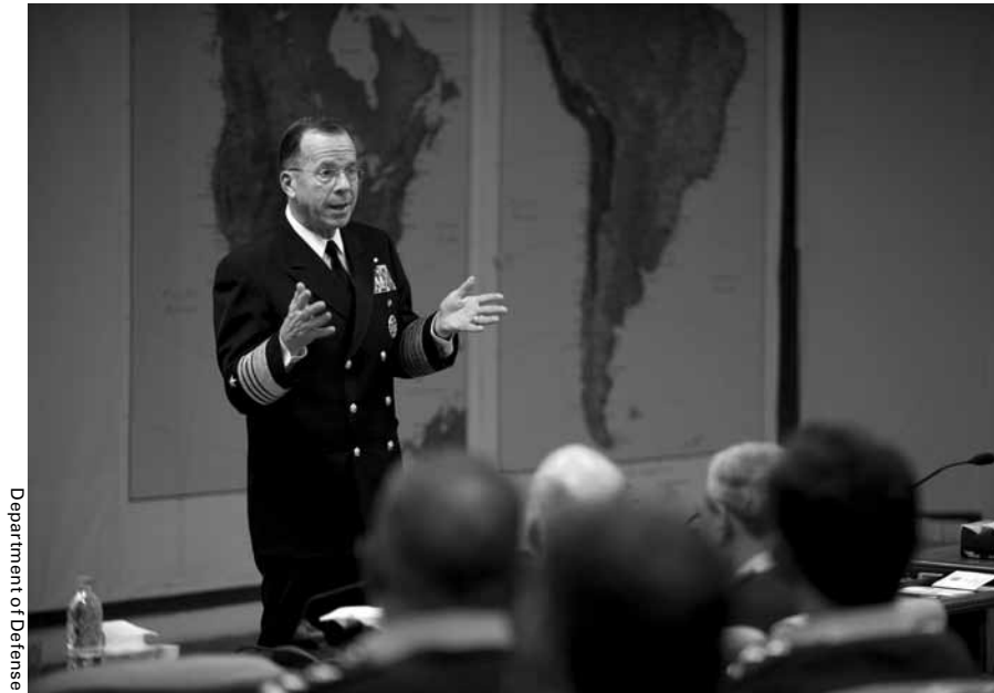
Department of Defense