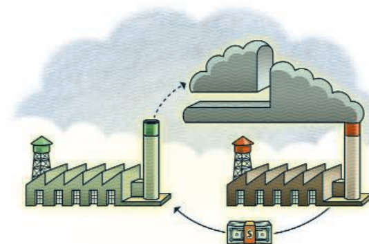
Pollution credits exchanged for cash.

Earth's climate is agnostic about the location and type of CO 2 emissions and is sensitive only to the total burden of CO 2 . It makes sense, therefore, to design a climate policy that taps all possible avenues to limit net CO 2 emissions. Trading of emissions across all sectors of the economy addresses this by allowing emitters to purchase carbon offsets from businesses that are able to lower their own emissions below their allocation. If trading were incorporated into an international system, U.S. firms and consumers could meet emissions targets at reduced costs by substituting less expensive cuts in, for example, developing countries, for expensive emissions cuts in the United States. Because investment would be funneled to