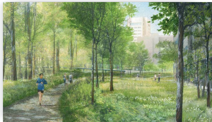
Restored woodland and biofiltration landscapes frame a pastoral setting around the new chemistry building (at right) along Washington Road. Jadwin Hall and Fine Tower are in the background.