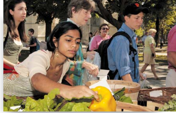
A new farmers market, open to students, faculty, staff, and local residents, was launched in fall 2007 at Firestone Plaza. Organized by students and several campus offices, the market is intended to educate the community about the benefits of local produce and the importance of sustainably produced food.