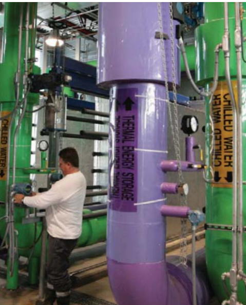
The chilled water plant and its 2.6 million gallon storage tank enables the University to purchase electricity at a lower cost to operate chillers during non-peak evening hours and store the chilled water for use during the day for air conditioning campus buildings and cooling specialized laboratory equipment.