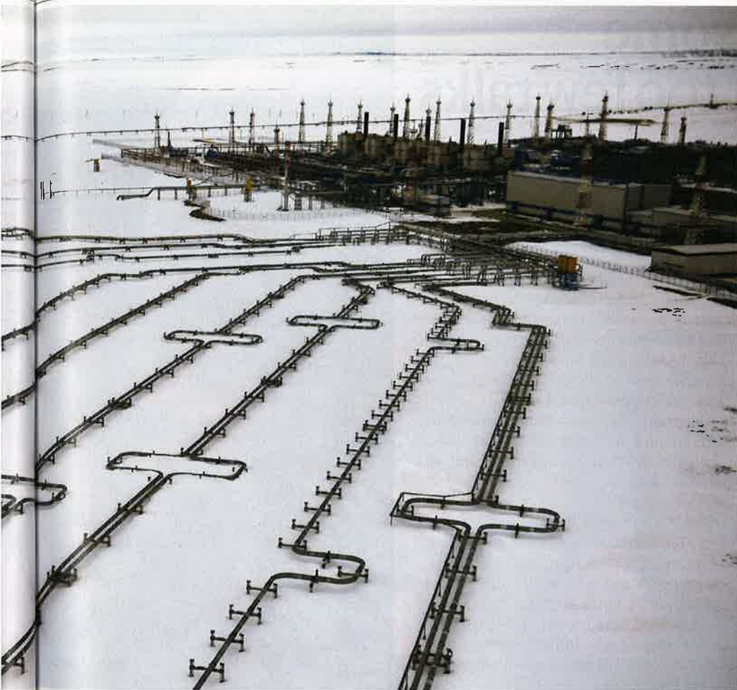
Russian natural-gas pipelines in northwestern Siberia.