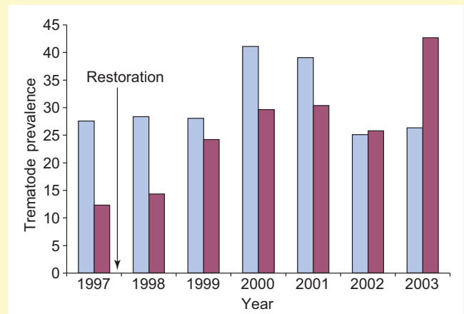
Figure 1. Using parasites to evaluate restoration. Changes in the prevalence of larval trematodes that parasitize snails over time from two types of site: control sites (light-blue bars) and restored sites (maroon bars) showing that, following restoration, trematode prevalence increased to a level similar to that in the control sites. In this instance, trematodes were a good measure of restoration success. Reproduced, with permission, from [51].

Although the concentration of trematodes is low in degraded estuarine habitats, it can increase following habitat restorations that attract birds [52]. The ease of sampling trematodes in snails enables much larger spatial and temporal replication for appropriate statistical comparisons of restoration effectiveness (Figure 1). Thus, there is increasing evidence that a healthy ecosystem is an infected ecosystem.