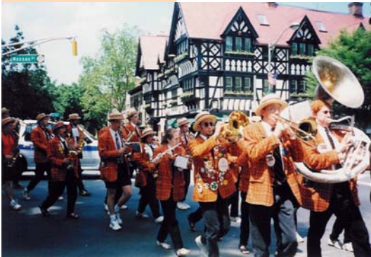
Above: The Band leads the P-Rade down Nassau Street.

The Newsletter for Princeton University Band Alumni