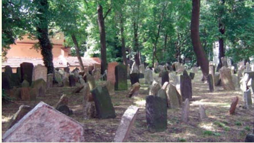
Jewish cemetery in Prague.

permeates into, the various meeting points between “the state” and “the Bedouin tribes,” and consequently, the part it plays in daily negotiations of belonging.