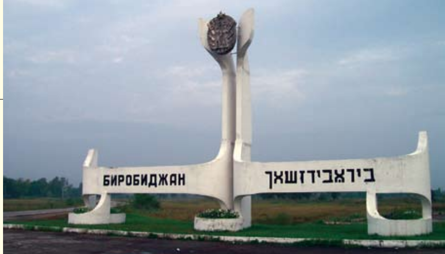
Entrance to Birobidzhan, spelled out in Russian and Yiddish.

This past summer, in an effort to study Yiddish, I traveled (by plane and then Trans-Siberian Railroad) to Birobidzhan, capital of the Jewish Autonomous Republic, which was established by the Soviet state in the late 1920s as an official homeland