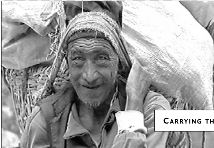
CARRYING THE BURDEN