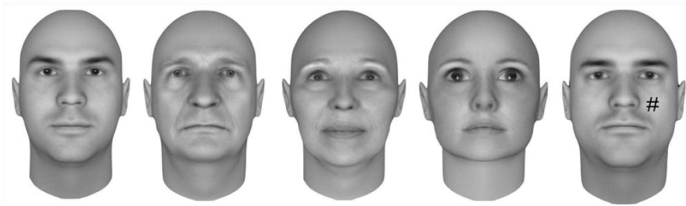
Figure 1. Examples of the four categories of faces used as stimuli and one example of a face containing a hash mark. From left to right: young man, old man, old woman, young woman, and young man with a hash mark. 74x22mm (600 x 600 DPI)