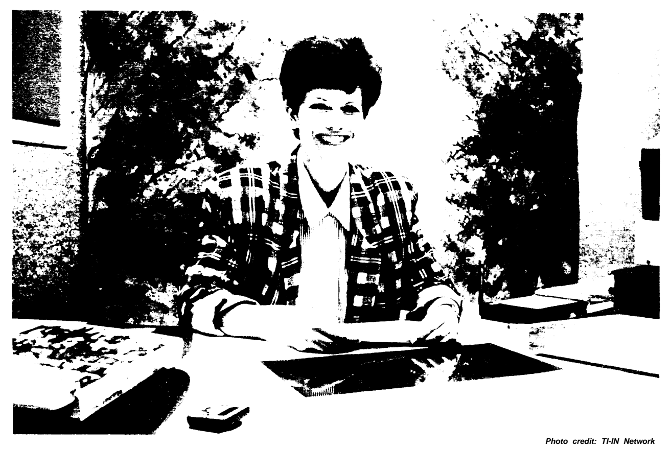
The key to any successful distance learning course is a good teacher.