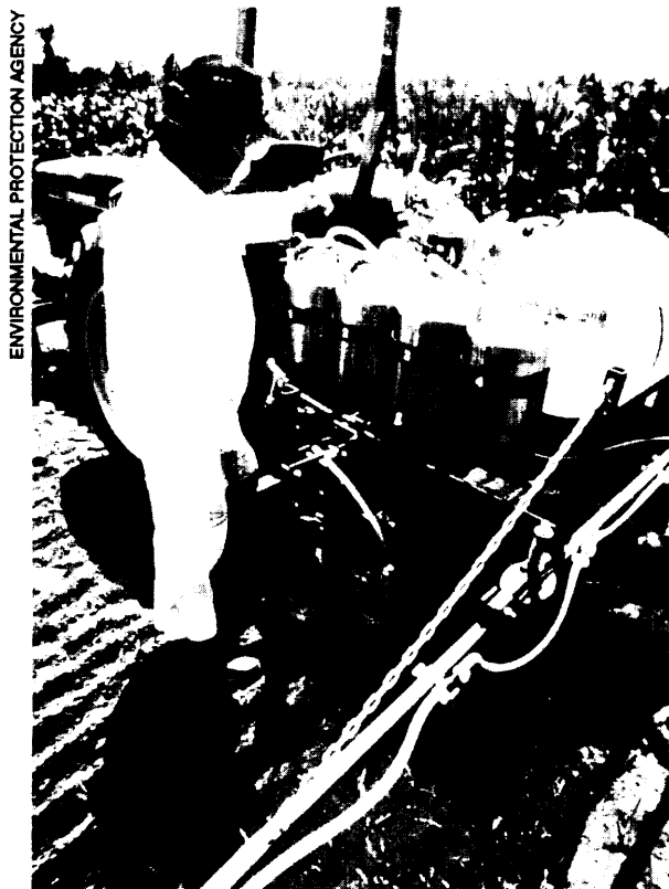
ENVIRONMENTAL PROTECTION AGENCY

SOURCE: Office of Technology Assessment, 1993, based on National Cancer Institute, Board of Scientific Counselors Meeting, March 1992.