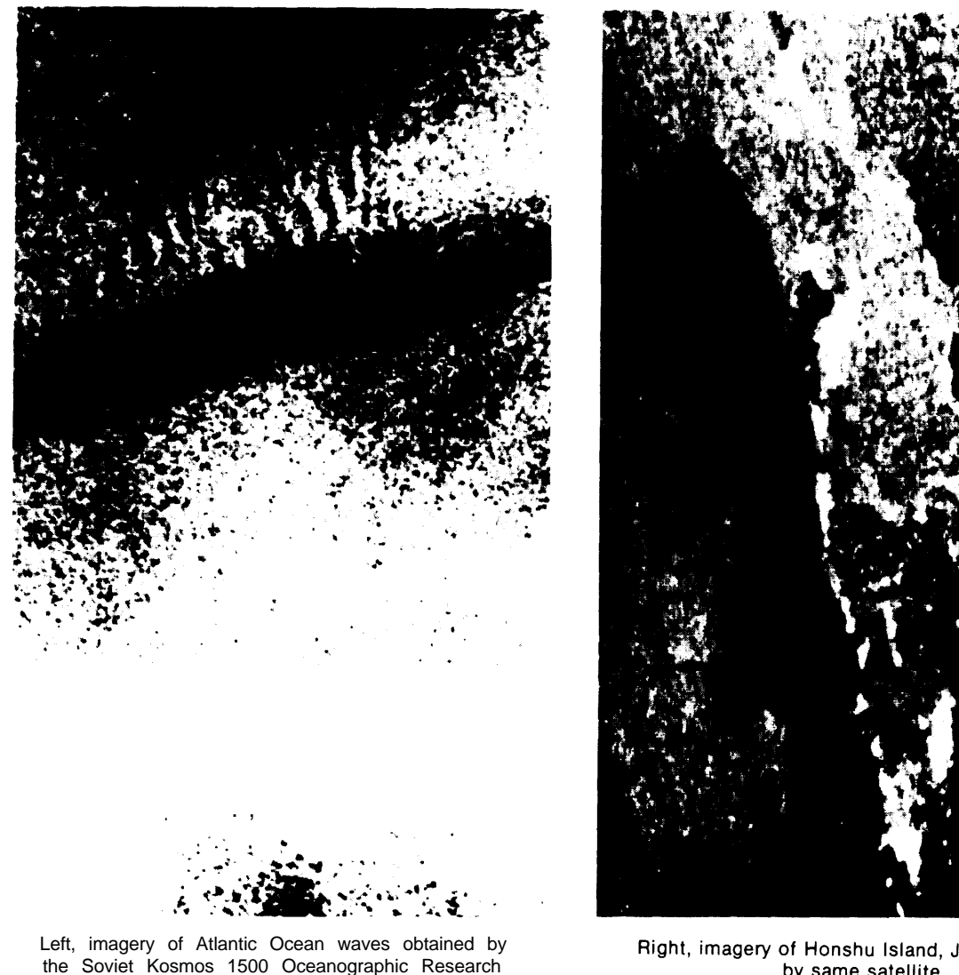
Figure 3-2.- Radar Imagery From Kosmos 1500