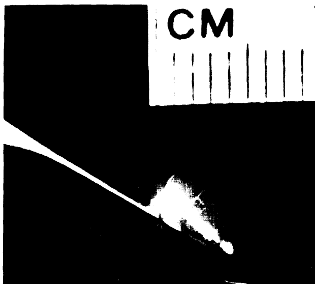
Organ Perfusion: Mouse Testis With Pipette Introduced Into Artery