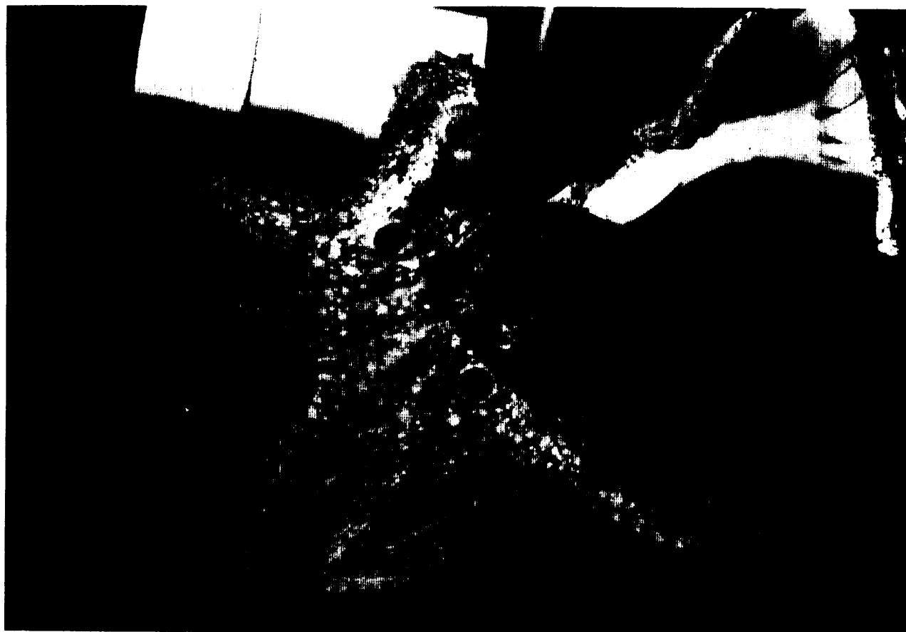
Octopus Octopus bimaculoides Cultured From the Egg in the Laboratory

Insects are valuable behavioral models in communication, navigation, learning and memory, and behavioral genetics.