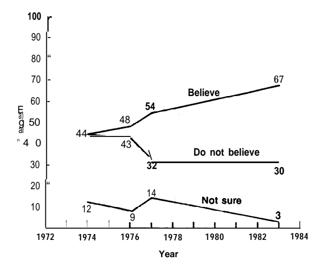
Figure 2.-Change in Percent of Public Believing That Files"Are Kept on Themselves<sup>®</sup>

Most Americans, from two-thirds to threefourths, believe that agencies that release the information they gather to other agencies or individuals are seriously invading personal privacy<sup>53</sup> (see table 4). But, as figure 3 indicates, significant percentages of the public believe that public and private organizations do share information about individuals with others.