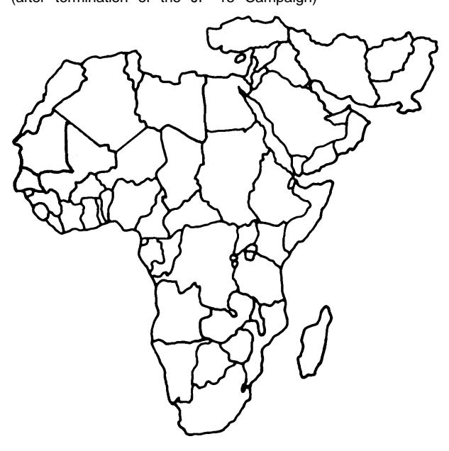
The situation after 1979 to date

The situation between 1976-79 (after termination of the JP 15 Campaign)