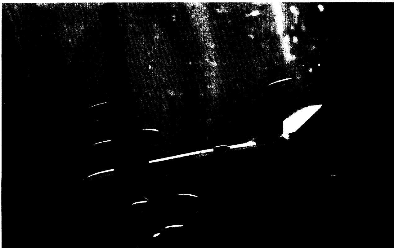
Figure 3—Reconnaissance and Bomber Versions of the Soviet Tu-95 Aircraft

Soviet Tu-95D reconnaissance plane (above), is distinguishable from the Tu-95H "Bear" strategic bomber (below) by the presence of additional radar pods and the absence of bomb bay doors.