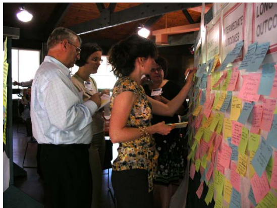
Education outreach activities and outcomes were written on about 2000 post-it notes and then sorted to develop 6 different logic models.