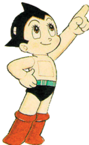
Astro-boy - Animated Superhero of Japan