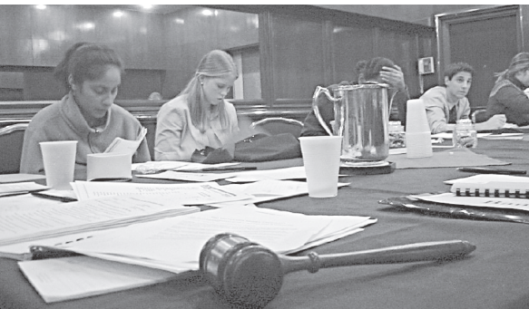
Highly prized, gavels are awarded to one delegate from each committee.