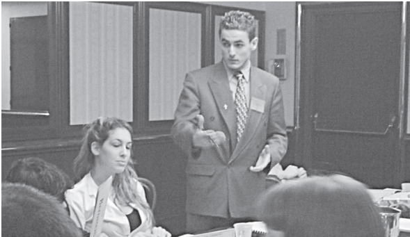
Delegates discuss and develop their own policy initiatives.

The following is a tentative schedule for the 2010 Princeton Model Congress: