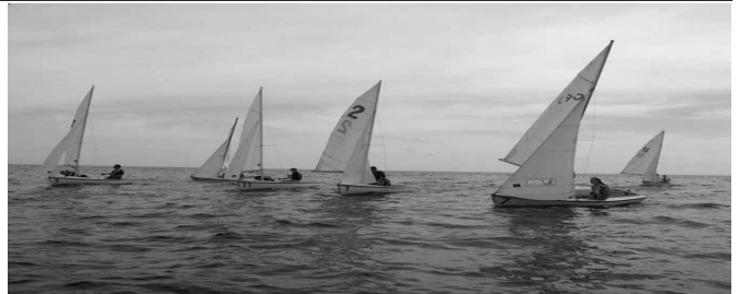
The team practicing in Raritan