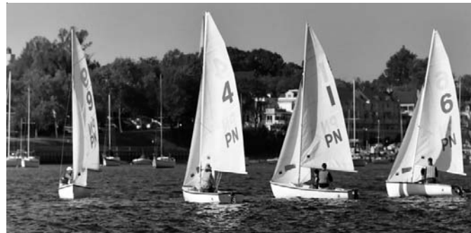
Practicing on on the Raritan River

The next weekend we doubled up, sending four freshmen to MAISA Open