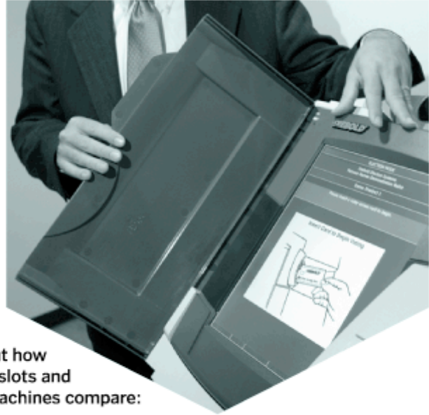
A look at how Las Vegas slots and electronic voting machines compare: