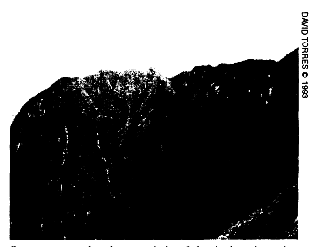
Steep topography characteristic of the Andes gives rise to significant climatic variations over short distances.

The primary zones of illegal coca cultivation include the Chapare in Bolivia, the Alto Huallaga in Peru, and a variety of areas around the Cauca Valley in Colombia (figure 1-2). These areas are characterized by high rainfall, acidic soils, and altitudes ranging between 200 and 1,500 meters above sea level (masl). Many of these areas are inappropriate for agriculture, much less for characteristic coca cultivation (22). There are a number of environmental concerns arising from coca production: deforestation to establish coca fields, soil erosion and associated fertility losses,