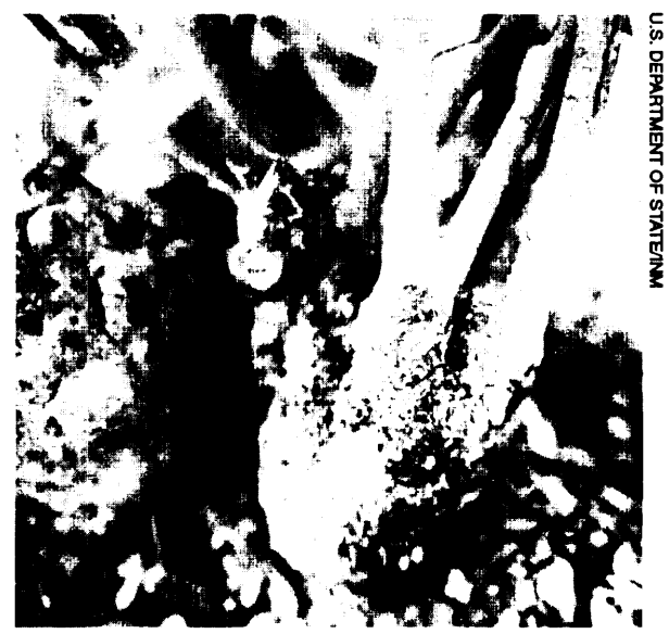
Some fungi and lichens are natural coca pests that may significantly reduce the plants' productive life. Here, lichen covers the stem of a coca shrub.

Option: Congress could direct the U.S. Department of Interior, Fish and Wildlife Service to conduct ecological studies of coca's role in the Andean environment cooperatively with host country counterparts.