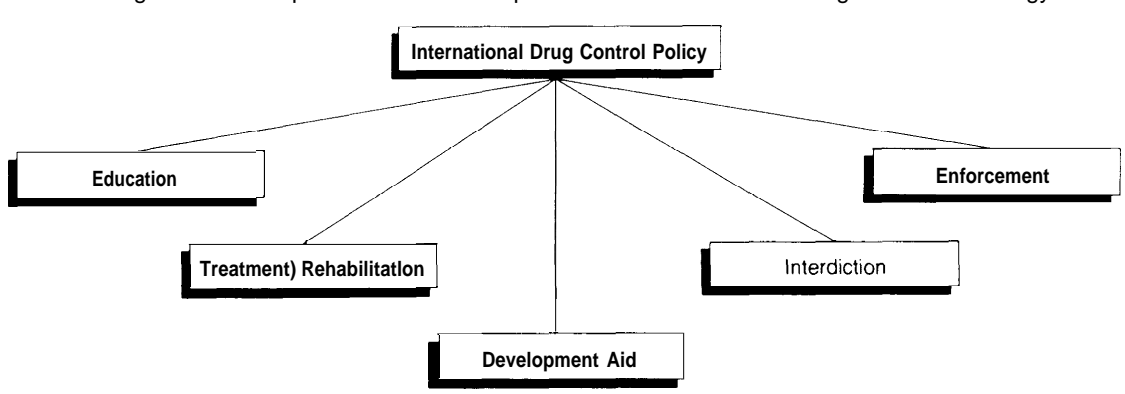
Figure I-I-Components of a Comprehensive International Drug Control Strategy