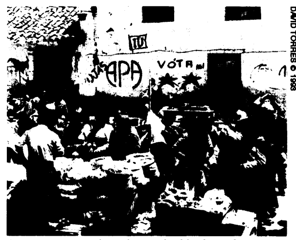
Access to external markets is highly dependent on adequate transport infrastructure. Largely, agricultural commodities produced in coca-growing regions are sold at the farm gate or in local markets such as this one in Peru.

Although several IARCS conduct research on crop improvements directly applicable to the Andean region, there are no similar institutions focusing on integrated farming systems such as polyculture and tree crop research (agroforestry)