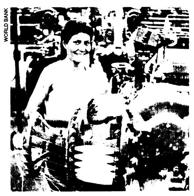
Developing value-added industries, such as this textile factory in Meellín, is one mechanism to diversify economies and increase the value of locally produced raw materials.

development efforts for Andean countries need to incorporate options for nonagriculturists as well.