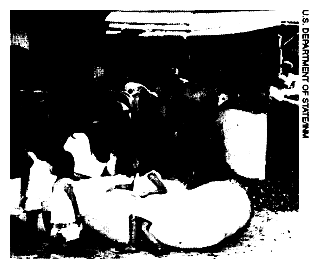
Coca retains its cultural and social significance for many Andeans today. Here, coca leaf (hoja de coca) is being prepared for transport to legitimate markets to be sold for traditional use.

Another constraint to reduction efforts is the lack of governmental presence in rural areas,