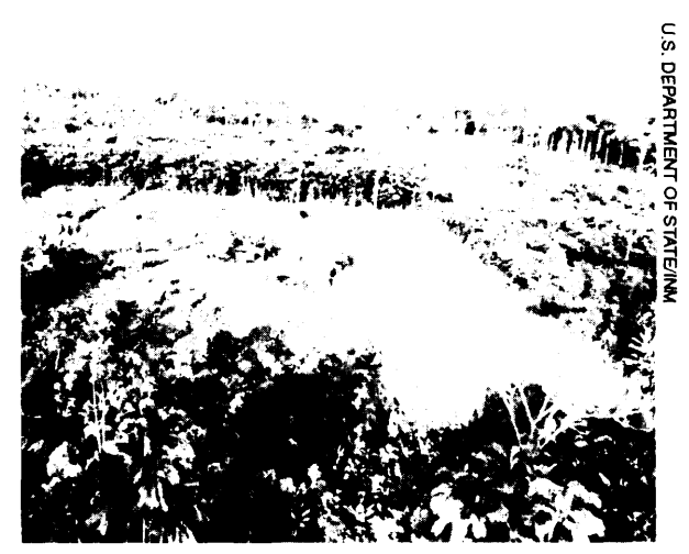
Small, remote landholdings characterize many cocagrowing areas. Production units often are less than 2 hectares in size, such as this minifundia.

Numerous national and international organizations have been actively involved in coca substitution projects in South America. Their activities include basic and applied research on potential