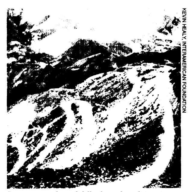
Steep topography and difficult road conditions in many rural areas may hinder expanded production of renewable resource products by limiting easy access to inputs and markets.

Despite the existence of alternative crops, production remains at low levels that inhibits entrance into lucrative markets. Opportunities are needed to expand the production base to increase product availability or aggregate the production