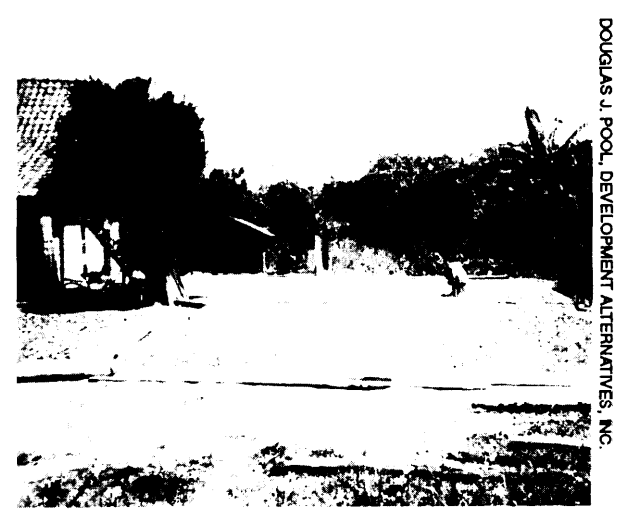
Coca farmers receive the lowest percentage of profit in the cocaine industry-perhaps as little as 1 percent. Here, a coca farmer in the Chapare is spreading the harvested leaves to dry them in preparation for sale.

Incorporating existing community groups and other grassroots organizations in planning and implementing alternative development programs could yield benefits in adoption rates. Bolivian crop substitution programs might work cooperatively with sindicatos to promote peaceful crop substitution and alternative development efforts. Such cooperative efforts would ensure local concerns were identified in project planning and encourage local understanding of the project process.