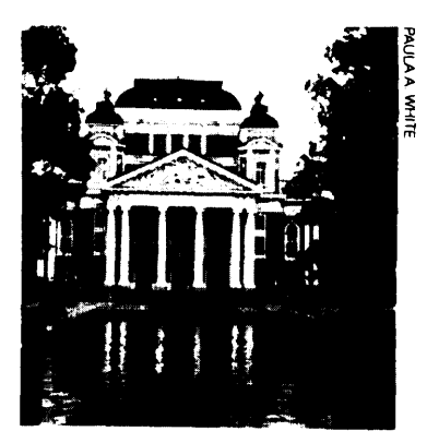
National Theater, Sofia.

The chief U.S. goal, over which there is no disagreement, is to promote the transition of formerly hostile East Bloc countries to democratic, market-oriented trading partners. The primary justification for U.S. assistance has been the "historic opportunity" to ensure world peace and the security and prosperity of American citizens that has arisen from the collapse of Communism and the end of the Cold War. Promoting political stability and economic