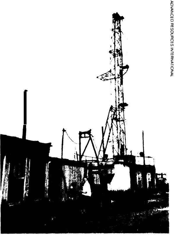
Coal coring exploration rig, Kuznetz Basin, Kazakhstan

Regardless of whether a country has embarked on a course of radical reform or has yet to take steps toward economic transformation, Americansponsored training programs in business skills are essential to promoting the idea of reform, supporting reform processes already under way, and making it easier for American energy-related firms to conduct business. The more active Congress wishes to be in promoting stability, modernization, reform, and U.S. business interests, the more it should expand programs in this area.