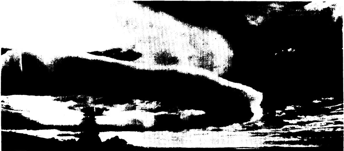
SEMIPALATINSK NUCLEAR TEST SITE

Nuclear explosion at the Semipalatinsk test site in Kazakhstan before 1963, when atmospheric testing ended.