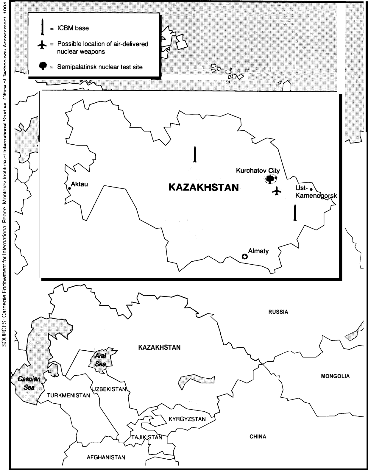
FIGURE 3: Selected Sites in Kazakhstan