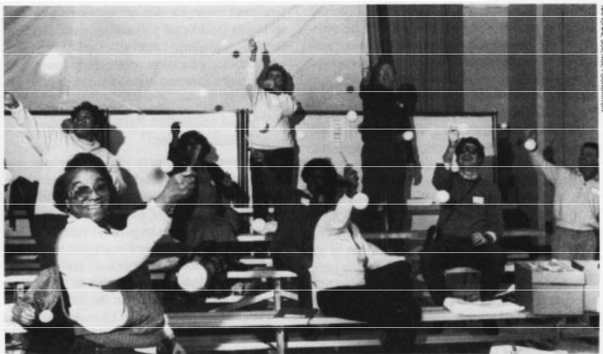
From 1958 through the 1970s, the federal government supported many workshops and summer institutes to help math and science teachers improve their teaching skills.

purview of NSF). Of particular relevance to technology were the institutes to train library and educational media personnel . The NDEA also provided grants for schools to acquire laboratory equipment and authorized a program of experimentation in educational television, radio, motion pictures, and similar media; teacher training was not supported to any meaningful degree under these two programs.