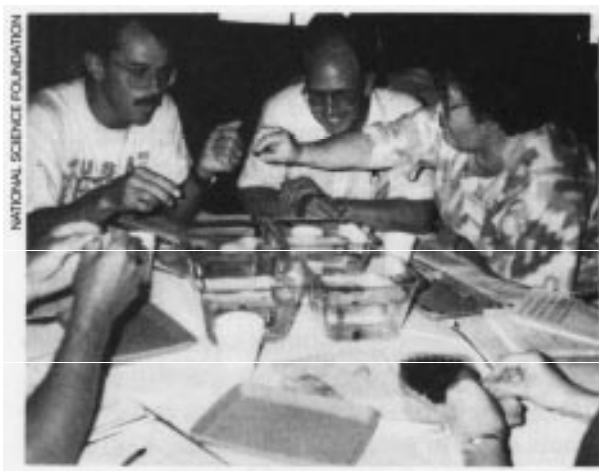
Following the standards set by the National Council for Teachers of Mathematics and those of the National Science Teachers Association, teacher training programs sponsored by the National Science Foundation encourage teaching with "hands-on" science, math, and technology activities.

component for teacher support and development. 55 These teacher activities are less formal than those sustained by NSF's Teacher Enhancement program, but are important because they yield valuable information about the kinds of support teachers need to assimilate advanced technologies into their instruction. Support has been in areas of intelligent tools and learning environments (e.g., an algebra workbench, microcomputer-based laboratories, exploration of virtual reality environments); knowledge-based systems and intelligent tutors (e.g., intelligent tutors in calculus, algebra, geometry, and science); and telecommunications and educational infrastructures (e.g., testbeds for educational networking in support of science and math education, worldwide Global Laboratory, and schoolwide Earth Lab projects). 56