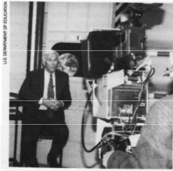
Star Schools funding has brought experts into even the most remote classrooms. Here Gene Cernan, the last astronaut to walk on the moon, discusses space exploration with students and teachers over an interactive instructional television network.

student learning. 21 And much of the Eisenhower-supported training was of low-intensity—an average of six hours of training per participant per year in LEA projects in 1988-89. 22