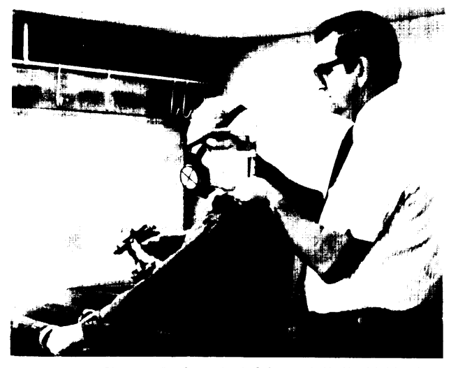
Environmental monitoring

Control of hazardous substances and their effects may be accomplished by engineering techniques designed to lower or eliminate exposure or by measures designed to protect individual workers (I). Engineering controls include the substitution of a less harmful material for a hazardous one, the alteration of a process to lower the