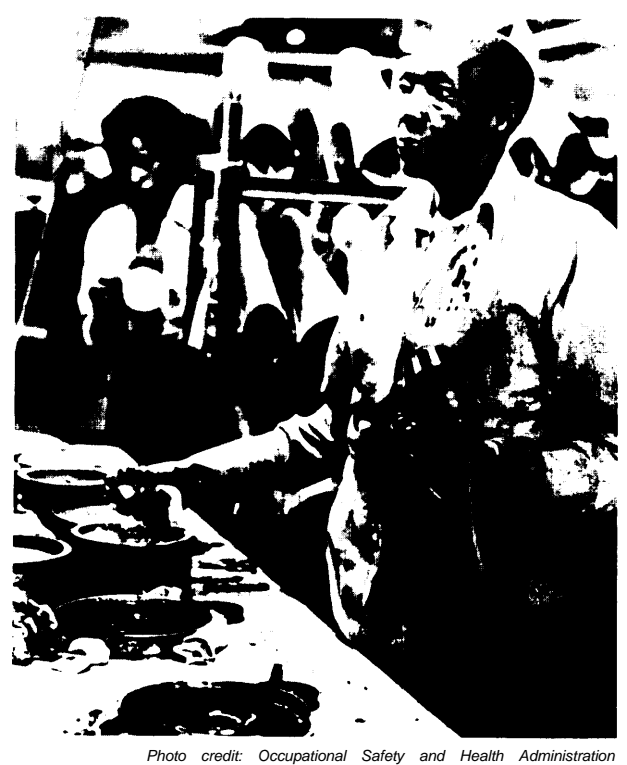
Exposure to chemicals in work-related environments over long periods of time can be hazardous to health

There are more than 55,000 different chemicals in commerce (14). The percentage of these that are hazardous at current exposure levels is unknown. Chemicals are found not only in companies that produce them but throughout the manufacturing sector. The National Occupational Hazard Survey (NOHS), conducted by the National Institute of Occupational Safety and Health, estimated that approximately 8.5 million workers were exposed to chemical hazards in the manufacturing sector during the years 1972 to 1974 (11). Because the manufacturing labor force grew at a 0.7 percent annual rate during the years 1973 to 1979, the number of exposed workers in manufacturing in 1980 may have totaled 8.9 million (11). According to the Occupational Safety and Health Administration, exposure to chemicals is the most important occupational health problem because of the number of workers involved (13).