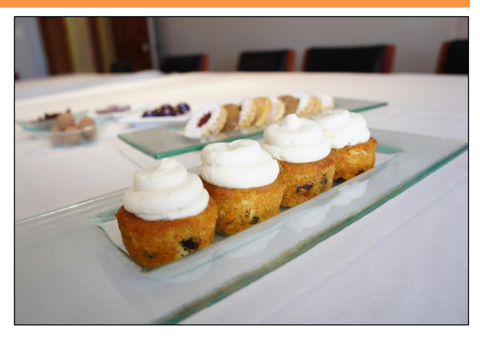
Desserts Choose 1 (Choice of 2, add $6.00 per guest) |

Add family style fruit platters to any dessert selection for an additional $4.25 per guest