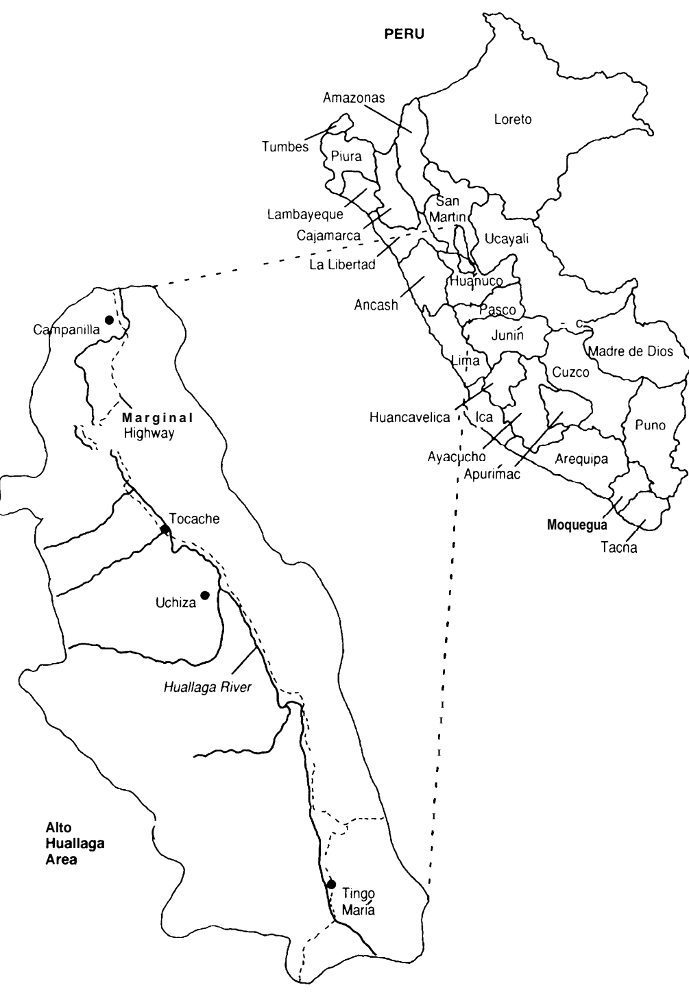
Figure 3-3-Location of Proyecto Especial Alto Huallaga