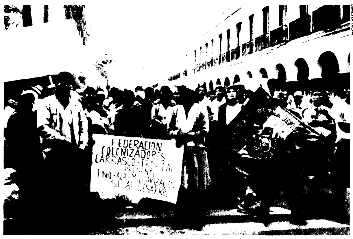
The conflicting militarization and development assistance objectives of past counternarcotics programs have undermined their effectiveness and often generated lasting resentment among target populations. Here, demonstrators in Cochabamba, Bolivia, carry a poster that reads, 'No to militarization! Yes to development!'

among coca producers, but also among other economic sectors, increasing the resentment of the farmers against CORAH as well as PEAH (19).