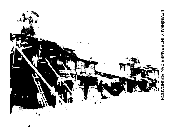
Many coca-growing regions lack sufficient infrastructure (e.g., roads, electricity, irrigation) for alternative development. How to improve infrastructure without unduly benefiting local narcotics traffickers presents a policy dilemma.

The U.S. Department of State's Bureau of International Narcotic Matters (INM) funded the first effort specifically intended to reduce coca cultivation in Bolivia. The project, Proyecto de Desarrollo y Sustitución? (Development and Substitution Project, PRODES), was to investigate the feasibility of crop substitution and produce a project proposal for implementing crop substitution through AID. The 1980 Bolivian coup halted PRODES activities and U.S. assistance was suspended (26). Drug related activities escalated