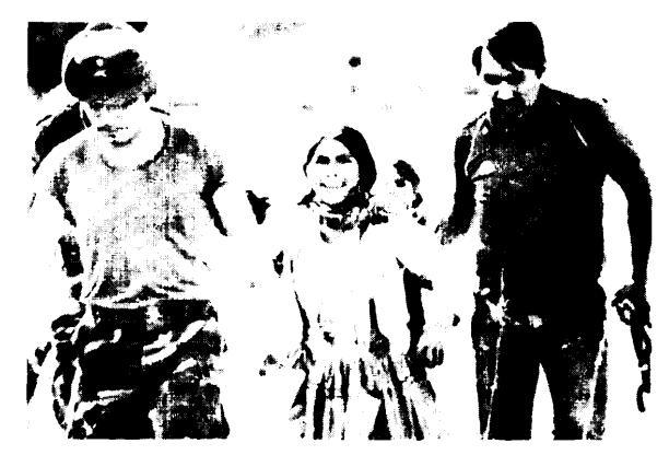
A disproportionate number of those arrested and imprisoned for illegal, coca-related activities are peasants. Eradication and crop substitution policies further heighten distress and conflict in coca-growing communities by forcing those least able to control the circumstances of their coca-trade dependency to risk impoverishment or imprisonment or both.

Turkey was identified as the most politically advantageous country for heroin supplyreduction efforts, The proximity of the country to European smuggling routes and laboratories convinced U.S. officials that Turkey was a key player in the heroin problem, despite the fact that only 4 percent of U.S. supply came from Turkey (31). U.S. supply-reduction goals were embraced by the Turkish military regime that gained power in