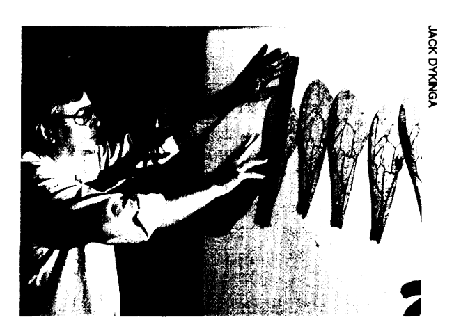
Fast and accurate species identification is essential for designing detection methods and management plans but distinguishing some species, e.g., European and African honey bees, requires expertise that is in short supply.

Traps can provide information on the presence and geographical distribution of NIS. Further information, such as the host, geographic origin, age, and sex of a NIS are potentially obtainable