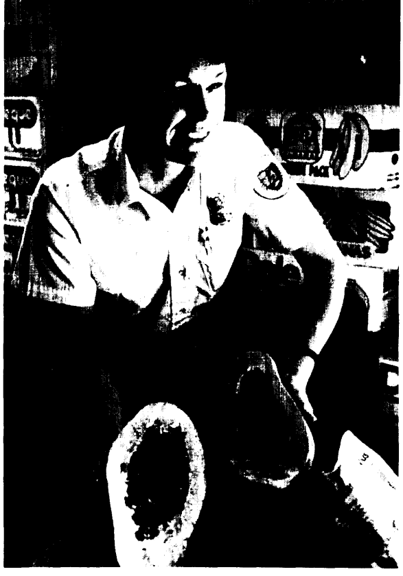
Inspections-before imports are shipped, at U.S. ports of entry, and after shipments are treated-are important means of excluding agricultural pests from the country.

Preferably, selective and efficient inspection technologies are used to reduce NIS introduction.