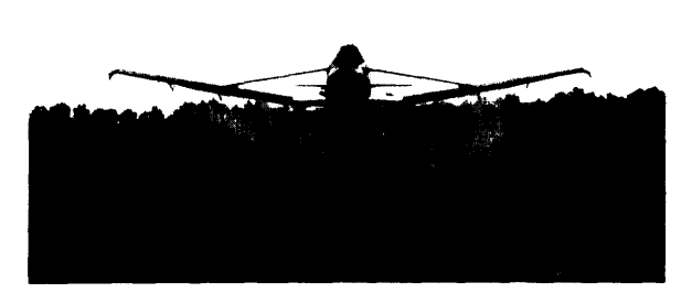
The boll weevil (Anthonomis grandis) eradication program integrates a variety of control measures: chemical pesticides, releases of sterile males, pheromone bait traps, and insect growth regulators.

Research establishes the needed economic thresholds and natural suppression factors. An understanding of the effectiveness of the control technologies and damage caused by different stages of pests is important. Because IPM does