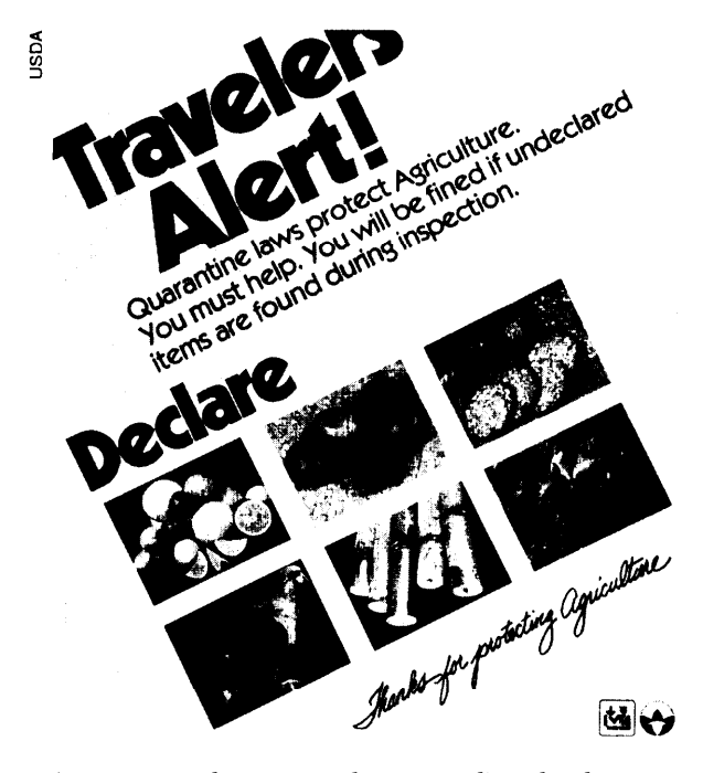
Attempts to educate travelers regarding the dangers of importing non-indigenous species have relied on posters and other written materials, with mixed success.

regulatory actions, and the environmental and economic risks involved (38). A well-organized, active public education campaign could disseminate such information.