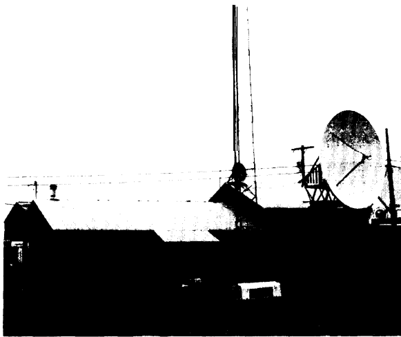
KOTZ-TV in Kotzebue, Alaska, 30 miles above the Arctic Circle. Broadcast and cable television stations in remote areas heavily depend on satellite transmissions to receive programming.

or ethnic populations—in ways that kiosks or service centers cannot. These media act as local partners in delivering information about government services to community leaders. For example, a Native American television station in rural Montana or a Korean newspaper in downtown Los Angeles is often more effective in delivering information about services than the government acting alone.