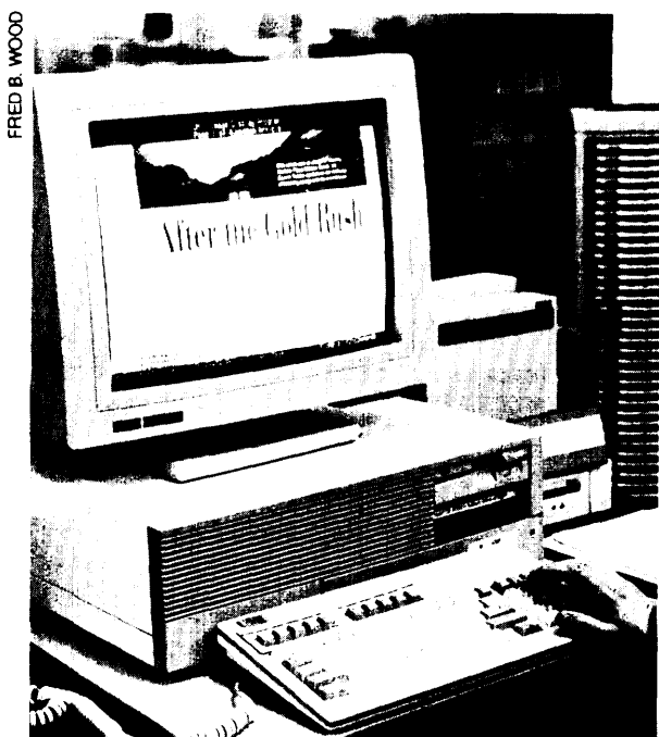
Compact optical disk reader at the Elmer R. Rasmuson Library on the campus of the University of Alaska at Fairbanks. CD-ROM technology is widely used in university libraries across the country.

appears on the screen. “They amended it,” she says to herself, and makes a note to call some of her neighbors. She opens a government directory to search for grants on rural development and information from the Consumer Information Center. She learned to use the networks mostly on her own, since they are now much more user-friendly. She also got help from the librarians in town and from other people on the network, including network assistants at all levels of government. Now she often helps the others.