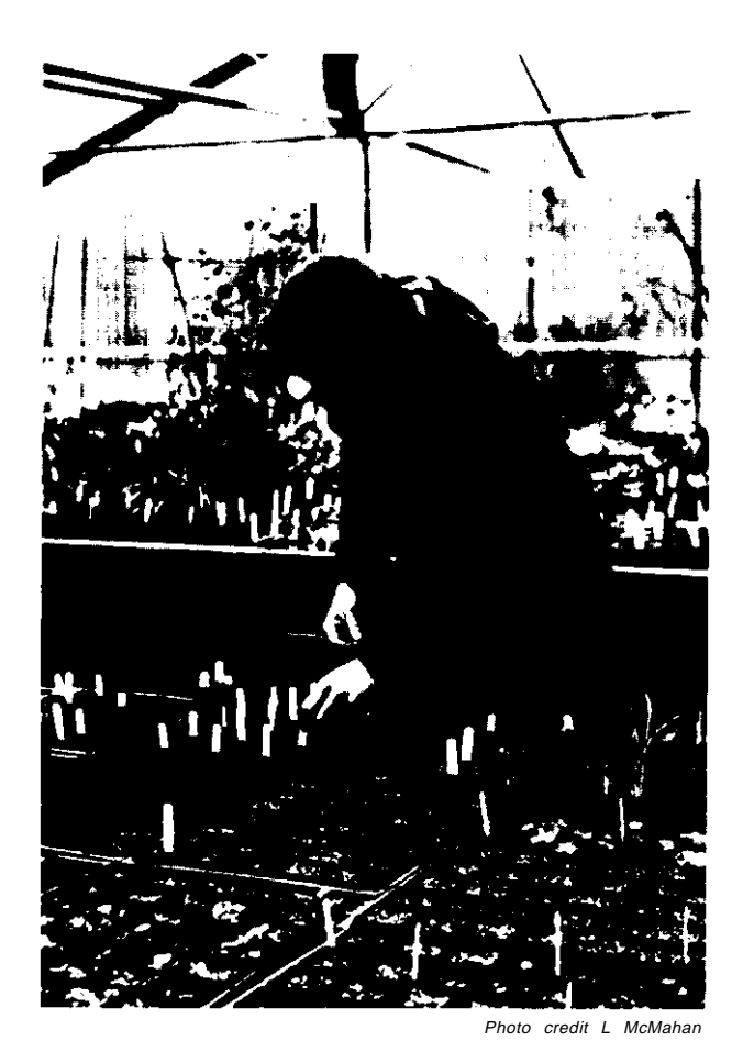
Greenhouses of the Berry Botanic Garden, Portland, OR, Botanic gardens are becoming increasingly important to the effort to conserve diversity.

for inclusion into the national program (16). CPC also has agreements with NSSL for longterm storage of selected wild species (40).