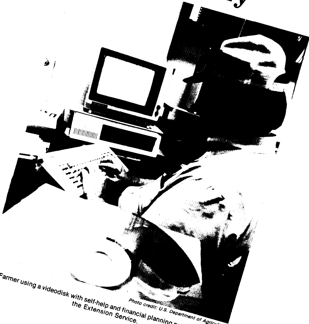
Farmer using a videodisk with self-help and financial planning programs from the Extension Service.