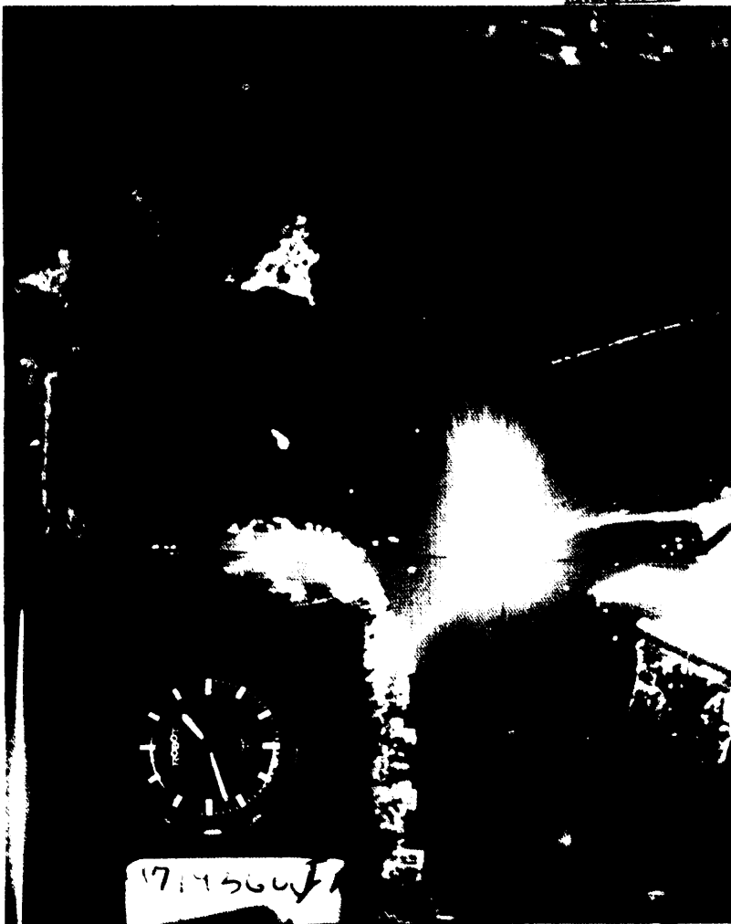
11/1/58 Photograph of RAF Radarscope