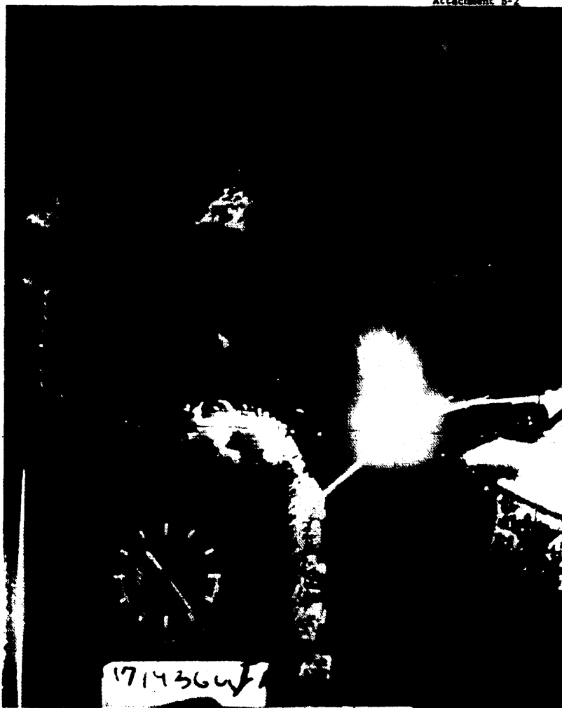
0139:02 Photograph of HAR Radarscope