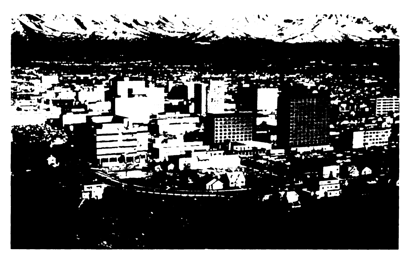
Ahg Age heChghM ebg d

United States retains absolute jurisdiction over these Native lands. These Native lands are not subject to State taxation except as provided by Congress. Lands that are conveyed to an Alaska Native without restraint on alienation under the Alaska Native Allotment Act are not subject to this absolute Federal jurisdiction and may be treated substantially the same as other private lands. <sup>14</sup>