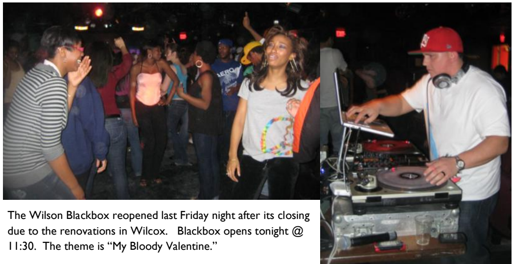
The Wilson Blackbox reopened last Friday night after its closing due to the renovations in Wilcox. Blackbox opens tonight @ 11:30. The theme is "My Bloody Valentine."